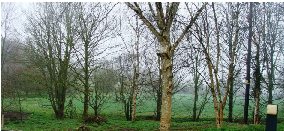
Picture 354. The field beyond the trees on the approach to the Village Hall clearly forms part of the open countryside.

(e) Exclude field to west of Village Hall. This farmland is open and forms part of the wider agricultural landscape. Its exclusion is clearly in accord with Historic England advice.