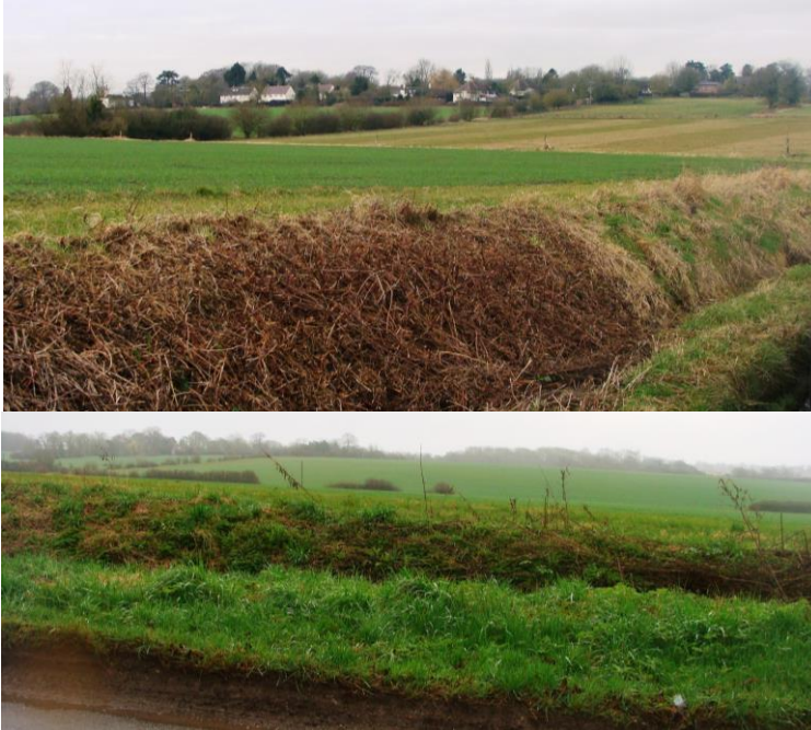
Picture 332-343. Extensive tract of open countryside/ farmland between Mill Lane and Castle Cottages extending south to land beyond Silver Street now excluded from the conservation area being contrary to National advice and local practice.

consultation the listed properties of Dove Cottage and Welspen Thatch together with the woodland adjacent to and to the north west of Welspen Thatch are proposed to remain within the conservation area.